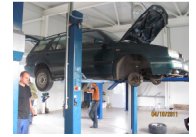
Mechanics course, MWB Moldova

Please pray for the students studying horticulture, pig-farming or car mechanics vocational courses at Ghidighici Farm, near Chisnau, that the young people will not only gain skills and a qualification for future life, but will experience God's saving love for themselves and a new direction and purpose for living.