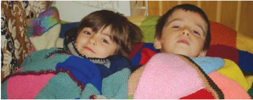
Two of the Vasiu children (Romania) enjoying some "Winter Rescue" knitting that arrived with their family's Christmas Love parcels (thanks to Operation Cover Up NZ)