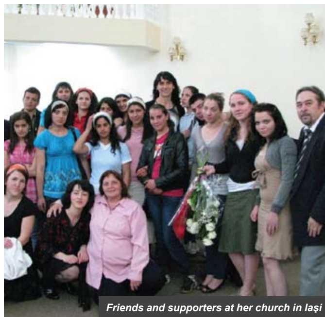
Friends and supporters at her church in Iași